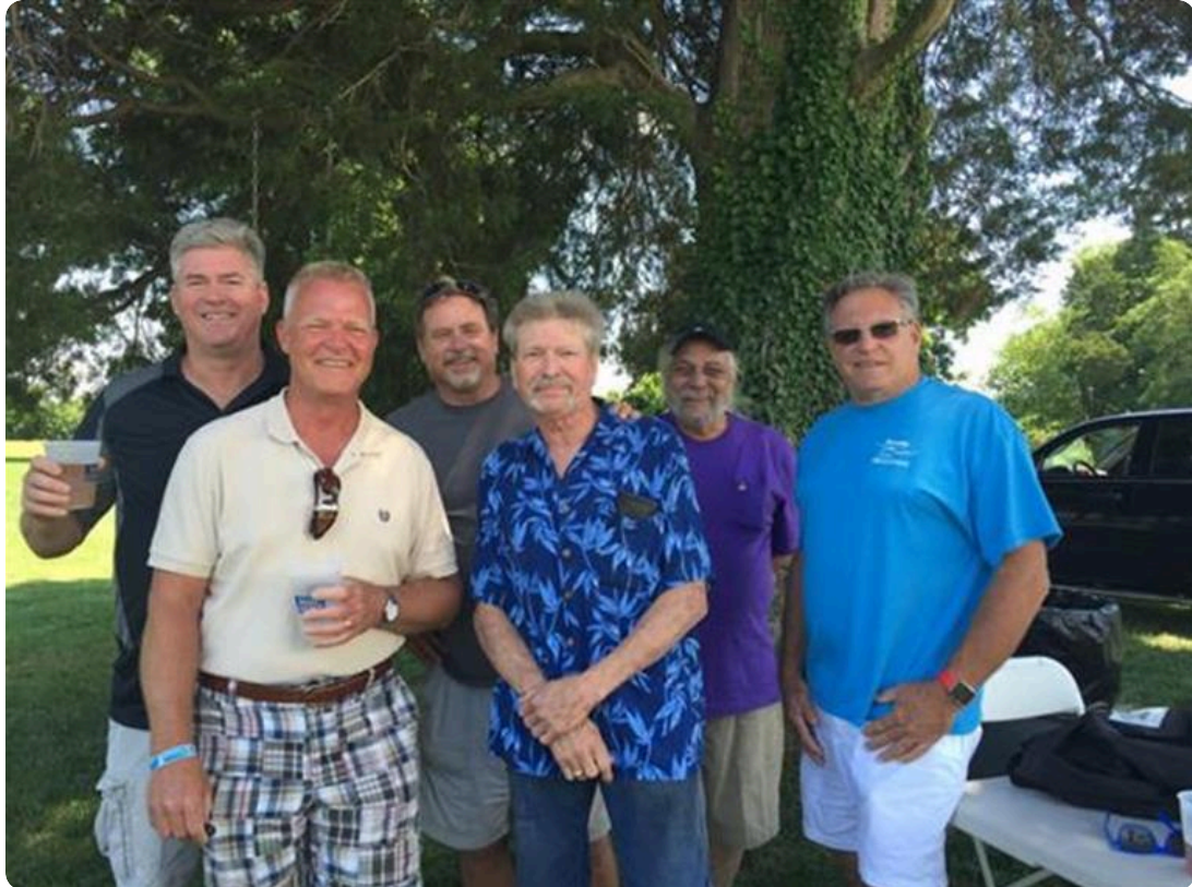
Calhoun M.E.B.A. Engineering School reunion, June 2016 Easton, MD.